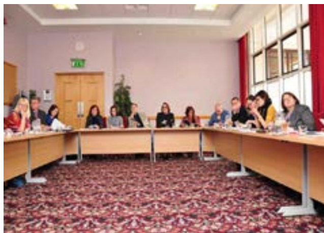
EQAVET Members discussing at the working groups

The cooperation with the higher education is important for the realisation of permeability – reciprocal recognition of qualifications. There is a need to create cooperation programmes between VET providers, universities and companies. VET and higher education have different models of governance. The involvement of the social partners can alleviate these differences; therefore initiatives should be put in place to involve them in the cooperation strategies.