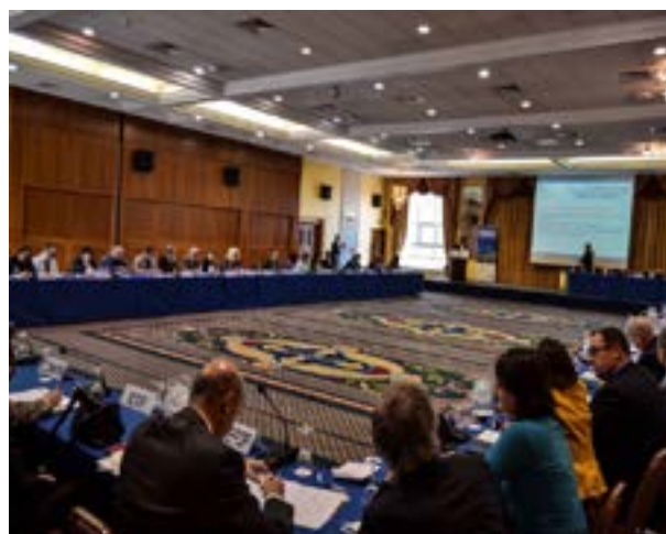
EQAVET Members during plenary session

This shift will contribute to advancing EQAVET-related strategic objectives and short-term deliverables of the Bruges Communiqué and address the priorities identified in Rethinking Education .